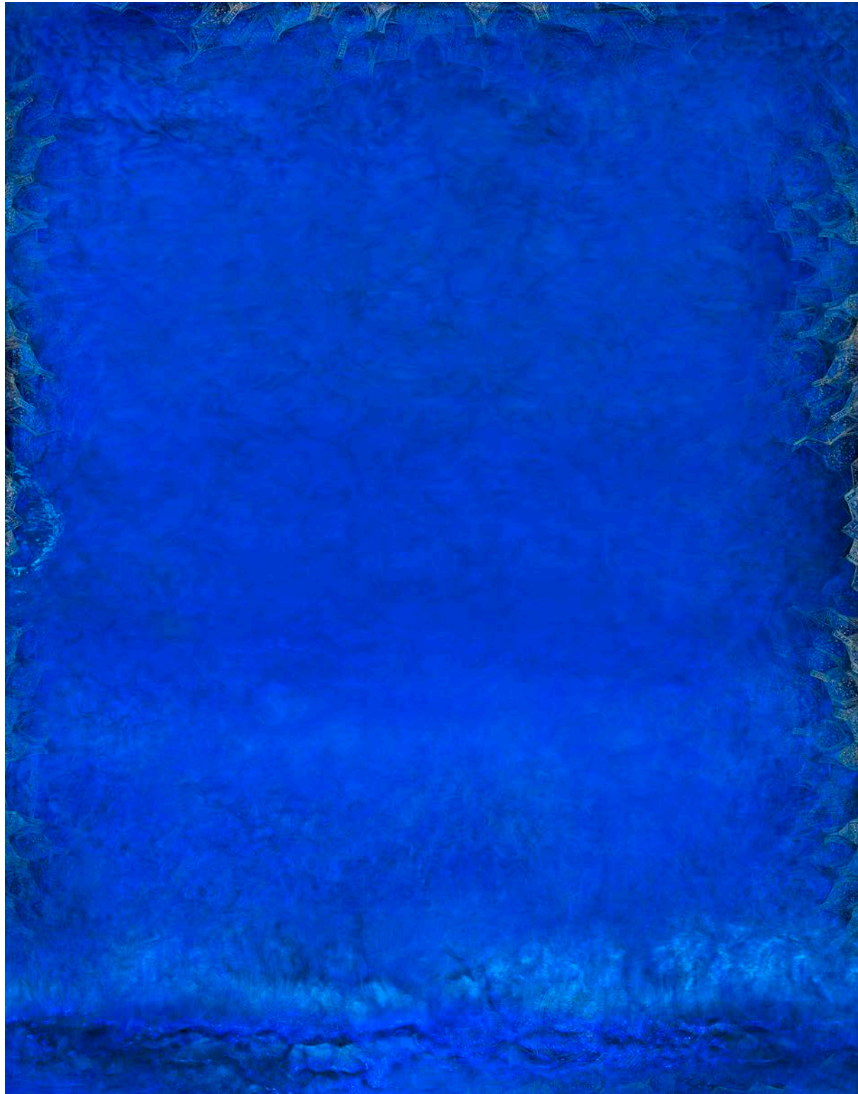
Acheiropoieta Persia, 1 of 4 / 1 AP, 175cm x 125cm, C-Type Print