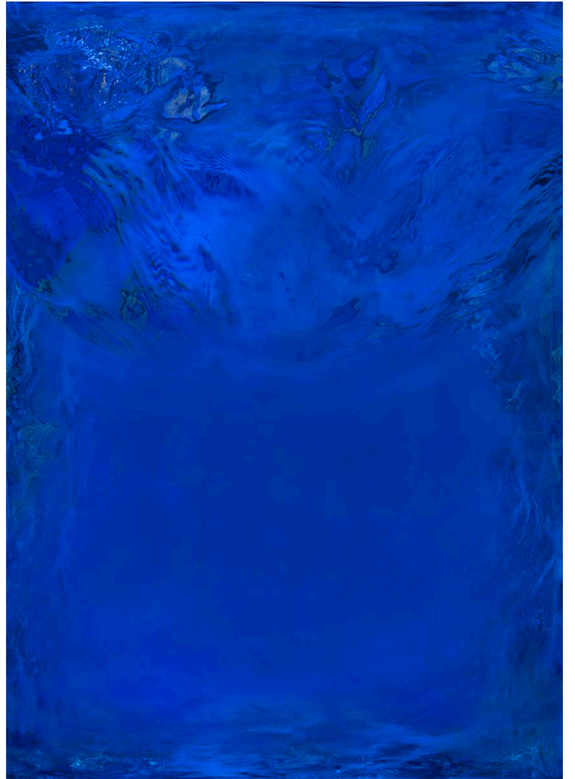
Trace the tidal shift # 3, 1 of 4 / 1 AP, 175cm x 125cm, C-Type Print