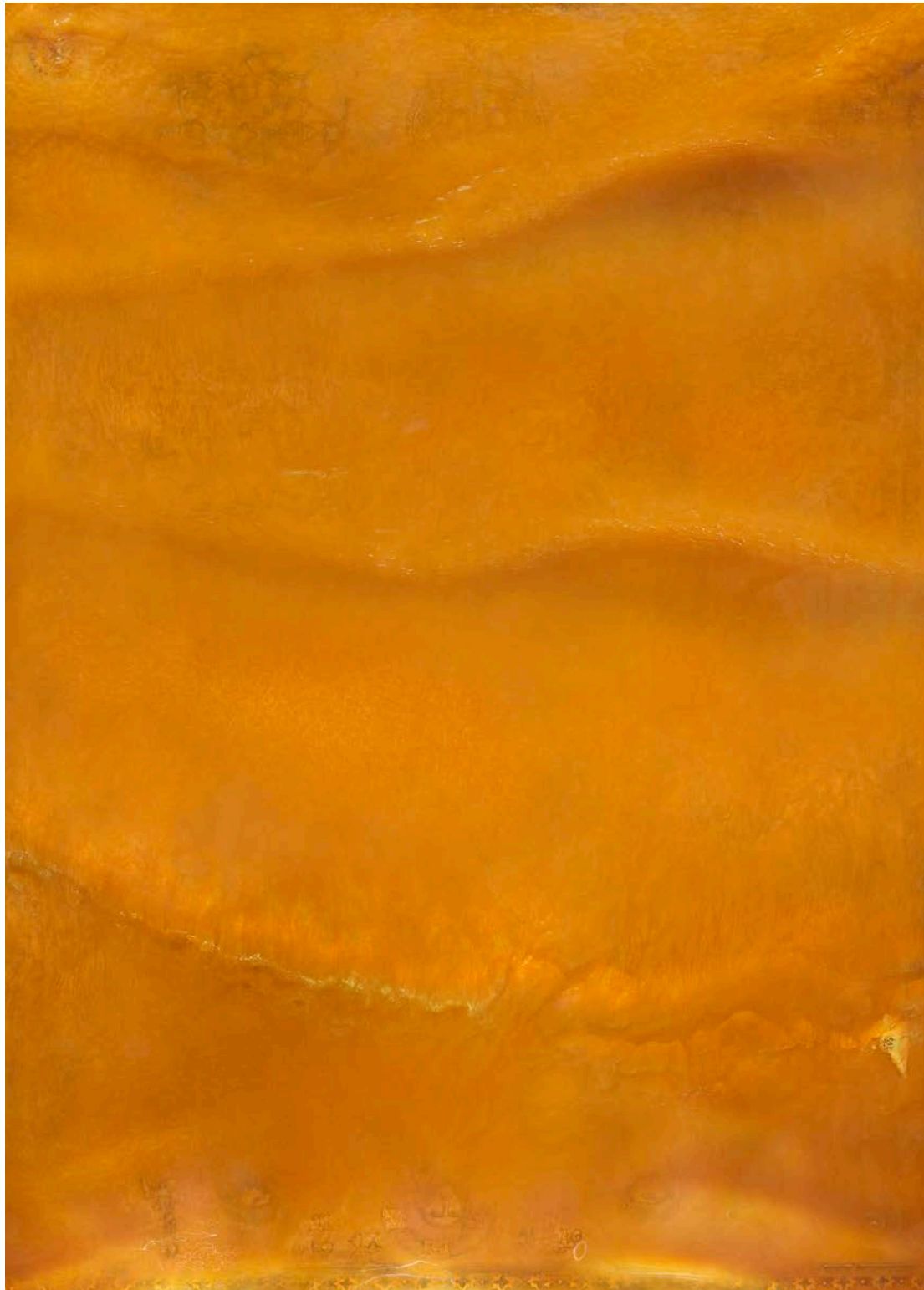
Hagia-Sophia, 1 of 4 / 1 AP, 175cm x 125cm, C-Type Print