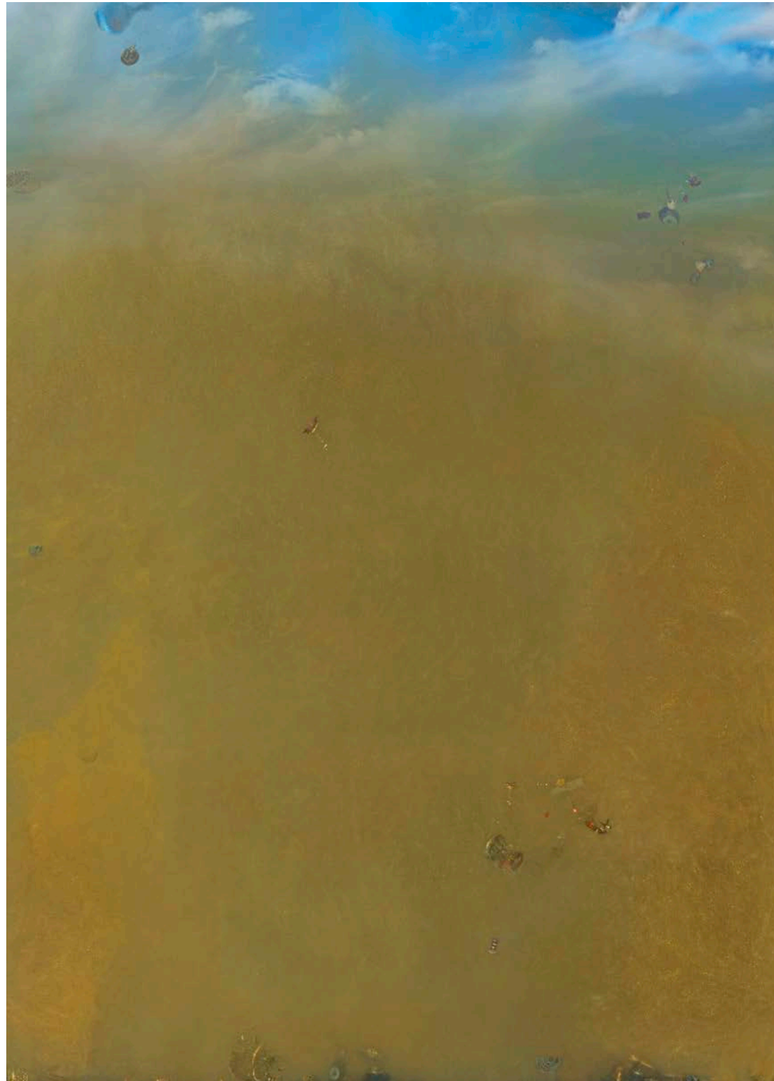
Archeiropoieta #4, 1, of 4 / 1 AP, 175cm x 125cm, C-Type Print