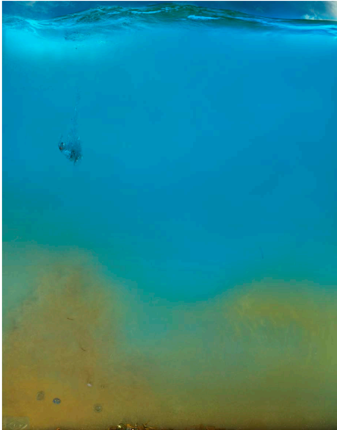
Drawing in Water _ Breath, 175cm x 125cm, 1 of 4 / 1 AP, C Type Print