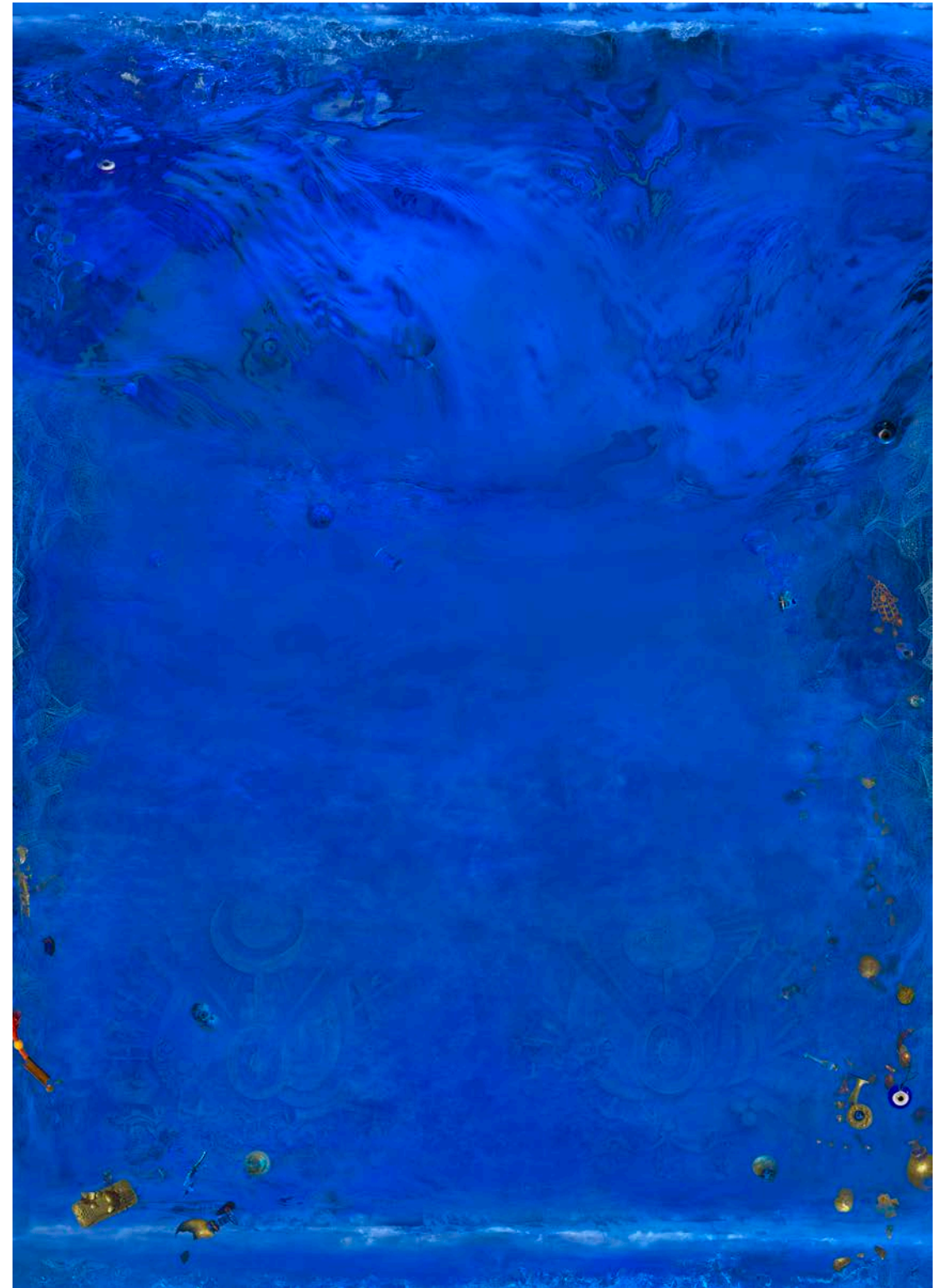
Trace the tidal shift, 1 of 4 / 1 AP, 175cm x 125cm, C-Type Print