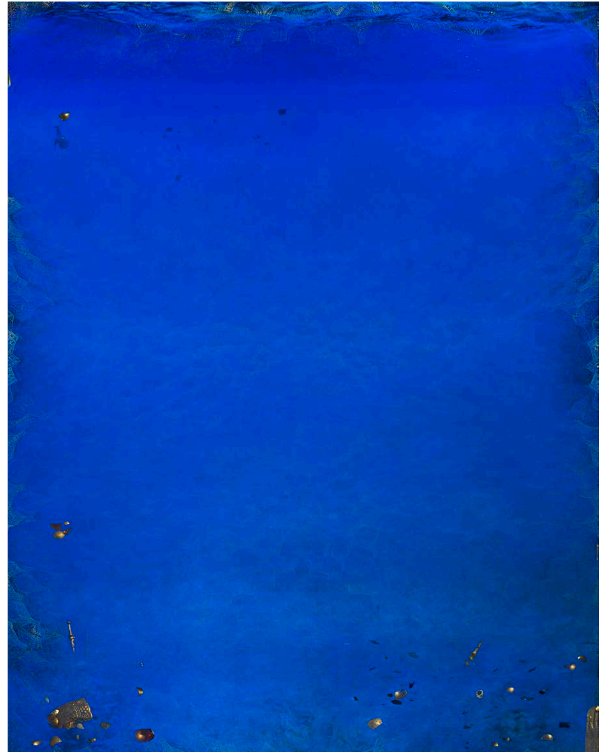
Acheiropieta Persia 2, 1 of 4 / 1 AP, 175cm x 125cm, C-Type Print