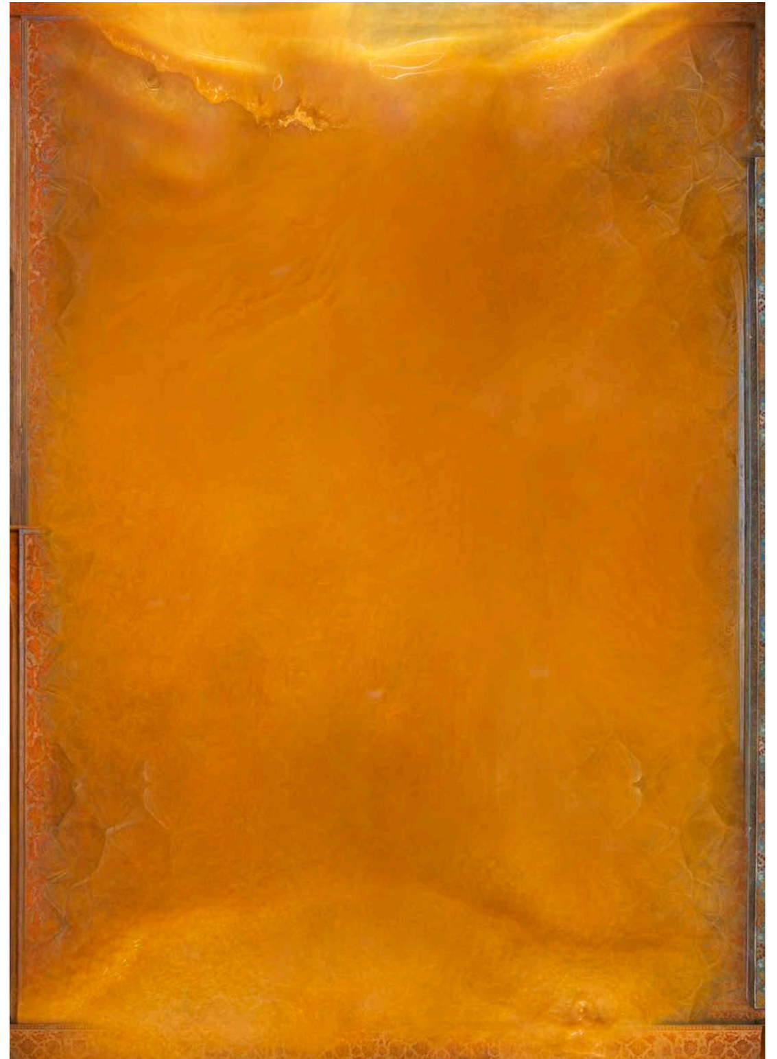
Drawing in Water #12, 175cm x 125cm, 1 of 4, /1 AP, C-Type Print