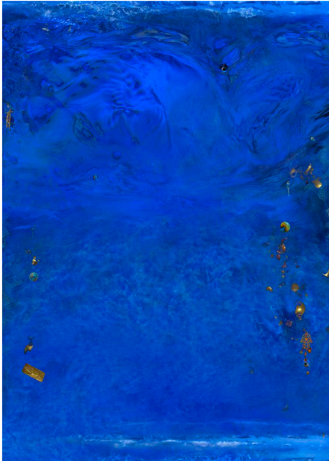
Trace the tidal shift #2, 1 of 4 / 1 AP, 175cm x 125cm, C-Type Print