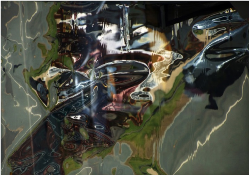
13. Attack Edition of 8 60 x 86cm framed $2400 includes framing