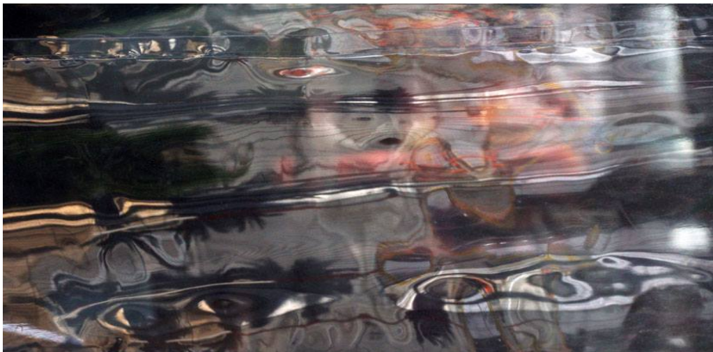
11. Cats Nightmare Edition of 8 75 x 119cm framed $2700 includes framing