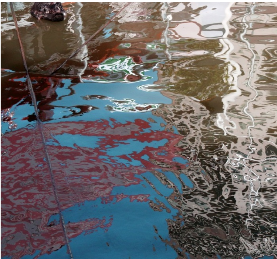
4. Dark Wire Edition of 8 86 x 86 cm framed $2700 includes framing