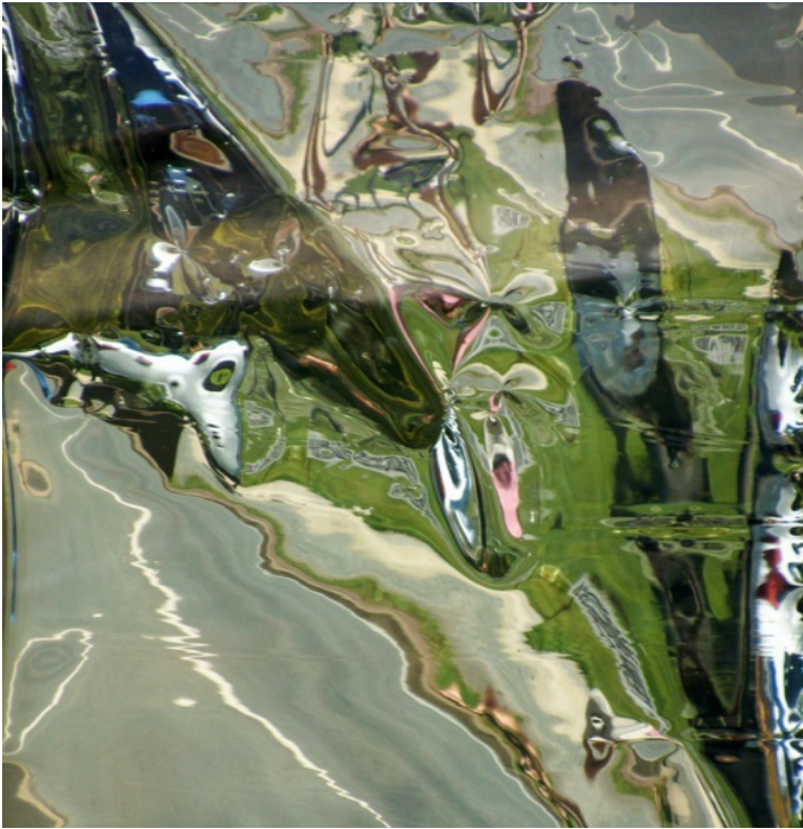
14. Nothing to see here Edition of 8 86 x 70 cm framed $2300 includes framing