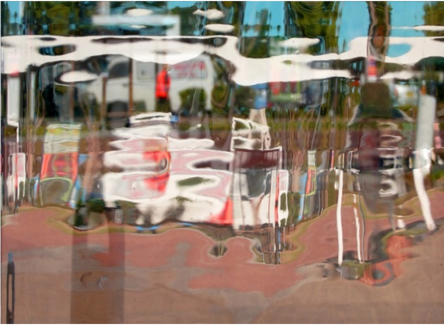
2. Shifting Ground Edition of 8 60 x 86 cm framed $2100 includes framing