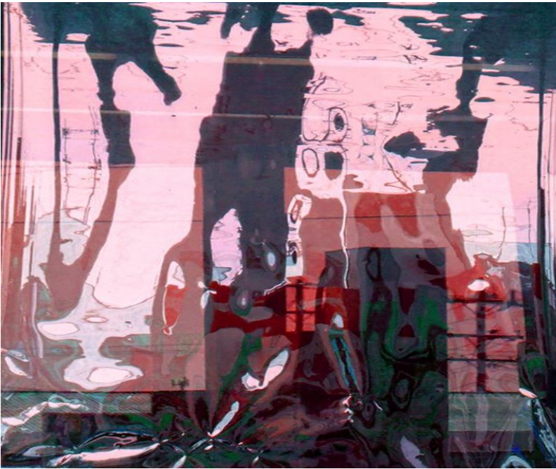
17. In the Window Bird on a wire Edition of 8 86 x 70 cm framed $2300 includes framing