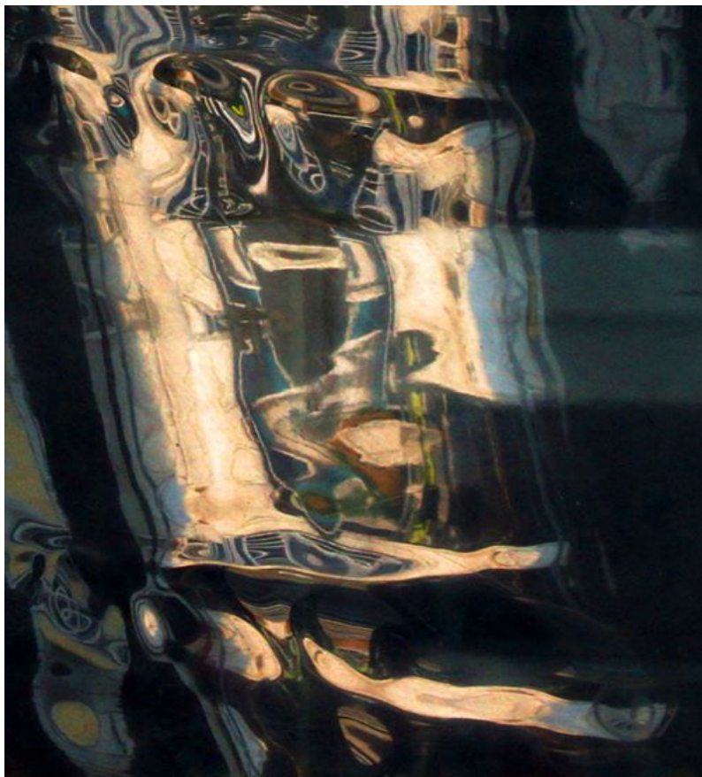
8. Puppeteer Edition of 8 86 x 70 cm framed $2300 includes framing