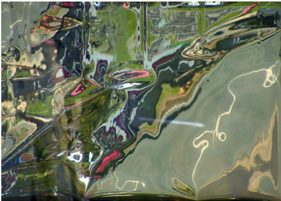
15. Listening Edition of 8 60 x 86cm framed $2400 includes framing