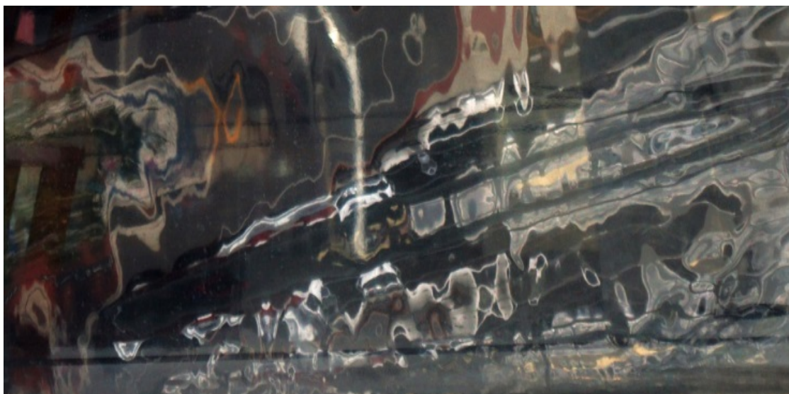
9. Train Wreck Edition of 8 40 x 86 cm framed $2100 includes framing