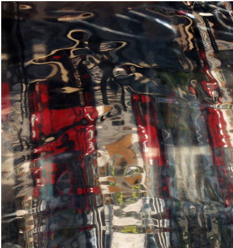
7. Tumult Edition of 8 100 x 80 cm framed $2400 includes framing