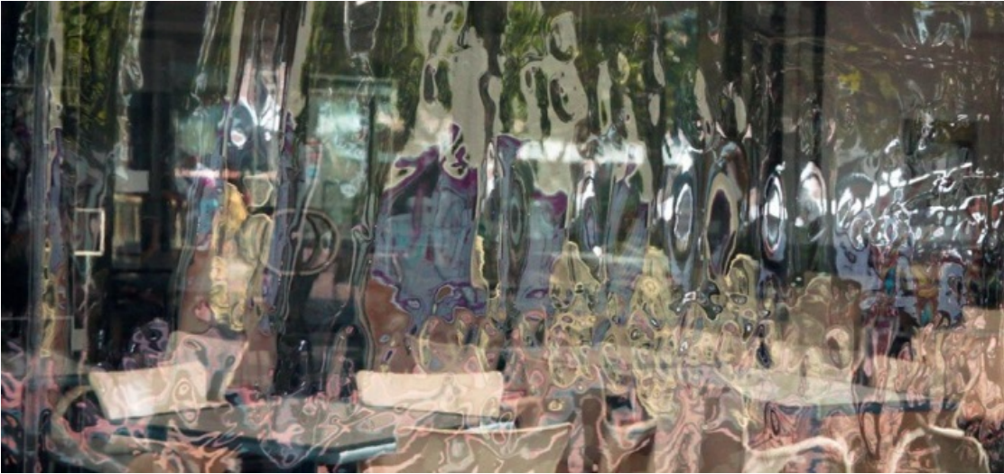
10. Ghost of Noisy Conversations Edition of 8 70x 140 cm framed $2700 includes framing