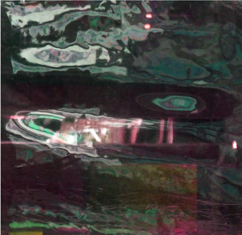
12. Dystopia Edition of 8 86 x 86 cm framed $2400 includes framing